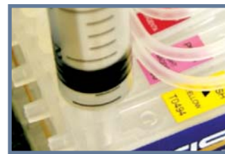
NEED REMOVE AIR WHEN FILL INK INTO EMPTY INK SYSTEM AT 1ST TIME